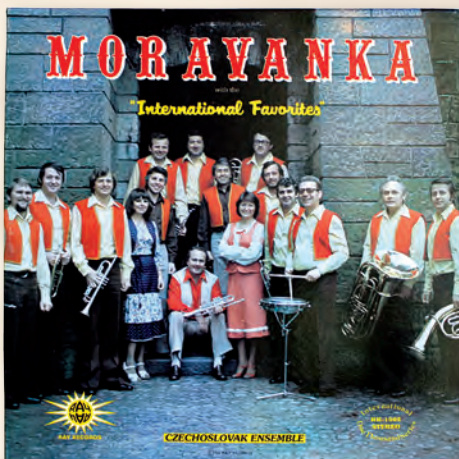
12" 33 RPM record album (vinyl): Moravanka — International Favorites . Ray Records, 1980.

When taken as a whole, the NCSML's phonograph record collection documents long-term shifts in musical genres, performance styles, orchestration and the development of the recording industry itself. For example, early American recordings aimed at the Czech and Slovak immigrant market featured a heavy European influence through the use of European musicians, arrangements and playing styles. The European influence lessened over time, giving way to a distinctly American quality to the recordings as Czech- and Slovak-American bands developed their own arrangements and playing styles. Concurrently, the Czechoslovak recording industry began exporting recordings to the American market. These recordings provided perhaps a more "pure" alternative to the American recordings, which were incorporating outside musical influences from other ethnic groups and musical traditions, like country & western.