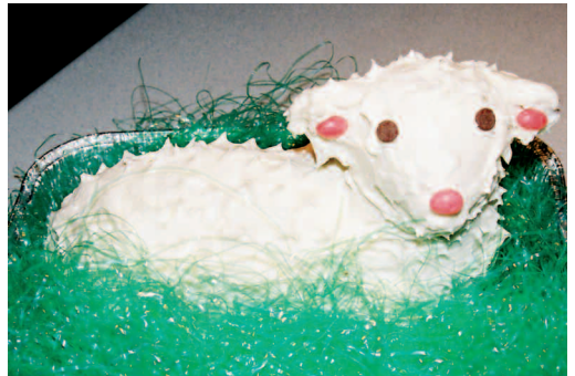
Lamb cake created by Grant Wright of Cedar Rapids, IA.

Winner of the children's division receives a $25 gift certificate to the NCSML store and a $5 gift certificate from Sykora's Bakery. Adult division winner receives a $50 gift certificate plus a $10 gift certificate from Al's Blue Toad restaurant. Although not required for competition, lamb cake pans are available for purchase in the Museum Store.