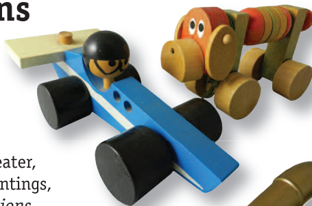
Gifts from Joan Sedlacek

Consisting of over 12,000 objects, the NCSML artifact collection is always growing. The collection includes textiles, dolls, decorated eggs, glass, pottery, musical instruments, paintings, drawings, furniture, and jewelry.