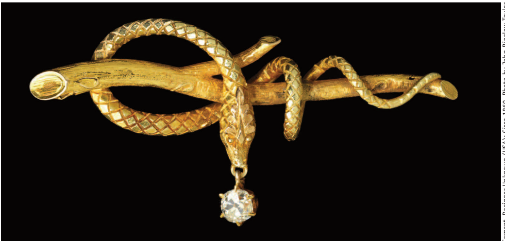
Serpent, Designer Unknown (USA); Circa 1860.