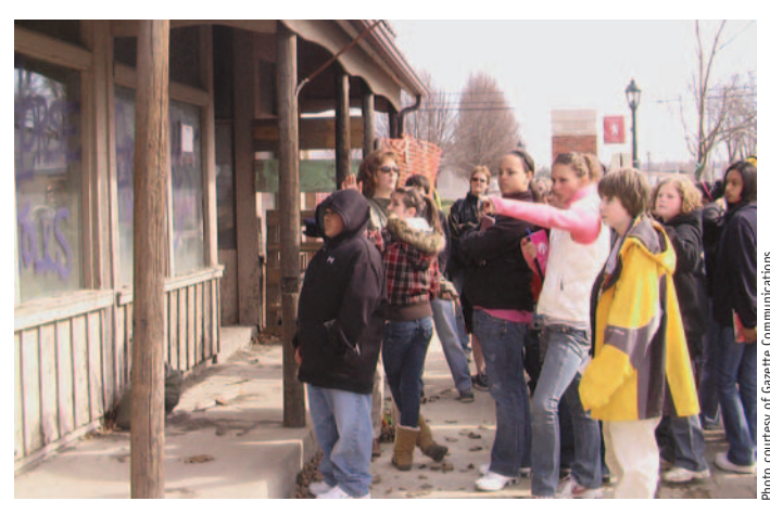
Seventh-graders, guided by NCSML educators, view the flood damage in Czech Village as part of their walking tour.

In conjunction with the exhibition, the NCSML will develop a curriculum that meets national standards and teachers' expressed need for a resource to help them teach their students about the flood of 2008. Days after the flood, 3rd grade teachers were asking for an in-depth tool to help address their students' questions and fears about the flood and what had happened to their city. This will serve as an addition to the existing NCSML curriculum for third graders about the immigrant experience. This curriculum meets