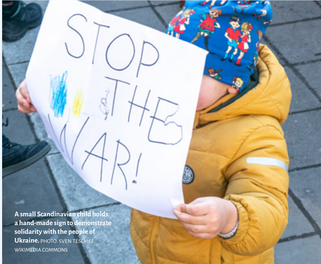
A small Scandinavian child holds a hand-made sign to demonstrate solidarity with the people of Ukraine.

хай живе Україна! Khay zhyve Ukrayina! (long live Ukraine) ■